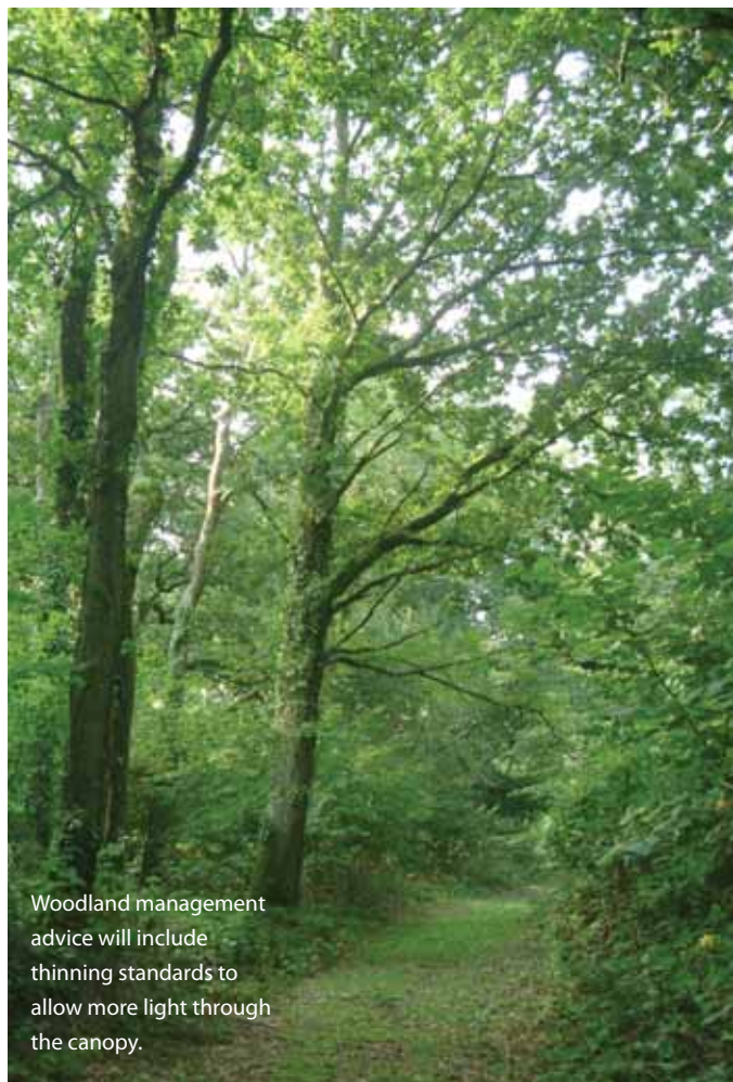
Woodland management advice will include thinning standards to allow more light through the canopy.

For a full list of the UK Priority Species and Habitats go to www.ukbap.org.uk