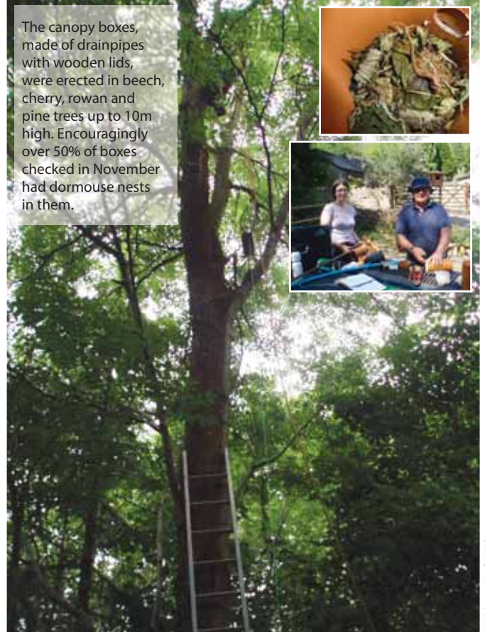
The canopy boxes, made of drainpipes with wooden lids, were erected in beech, cherry, rowan and pine trees up to 10m high. Encouragingly over 50% of boxes checked in November had dormouse nests in them.