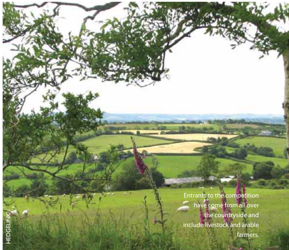
Entrants to the competition have come from all over the countryside and include livestock and arable farmers.

Landowners have been encouraged to increase the species diversity of their hedgerows to help dormice and other wildlife.