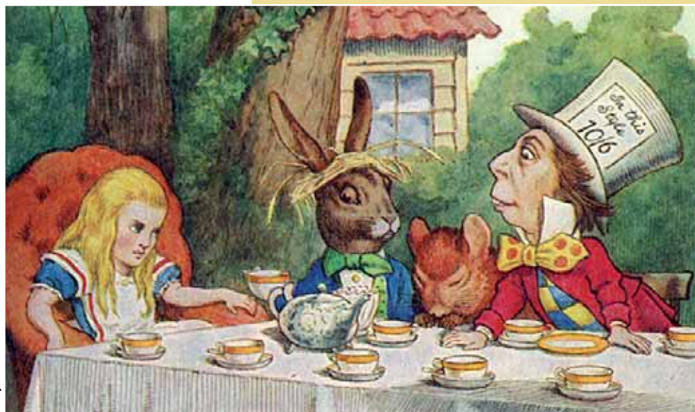
SIR JOHN TENNIEL