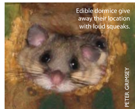
Edible dormice give away their location with loud squeaks.