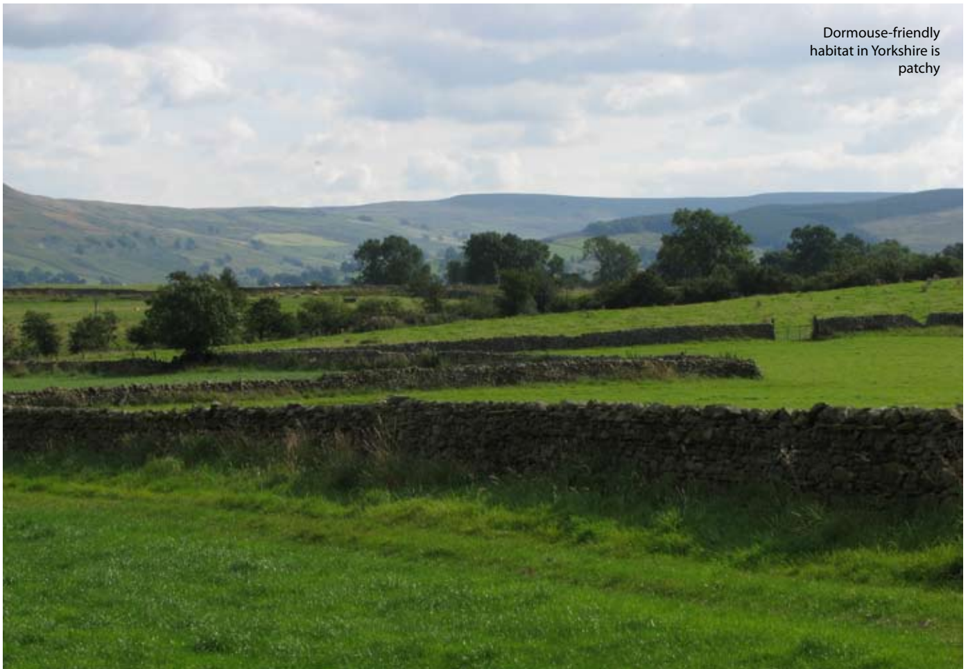
Dormouse-friendly habitat in Yorkshire is patchy