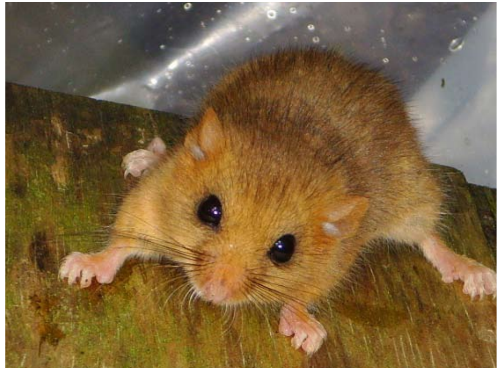
SUSAN - PLEASE HELP

The dormice used the boxes within Bontuchel Wood within the first 6 weeks, by the time we did the first survey there were nests in 7 of the boxes with one box containing two dormice, one chipped and